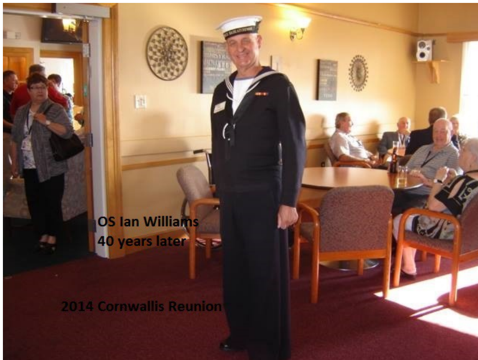
Cadets dressed in Museum Uniforms 2014