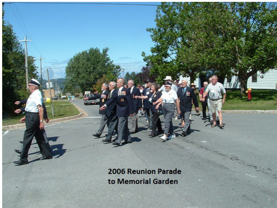
2006 Reunion Parade to Memorial Garden